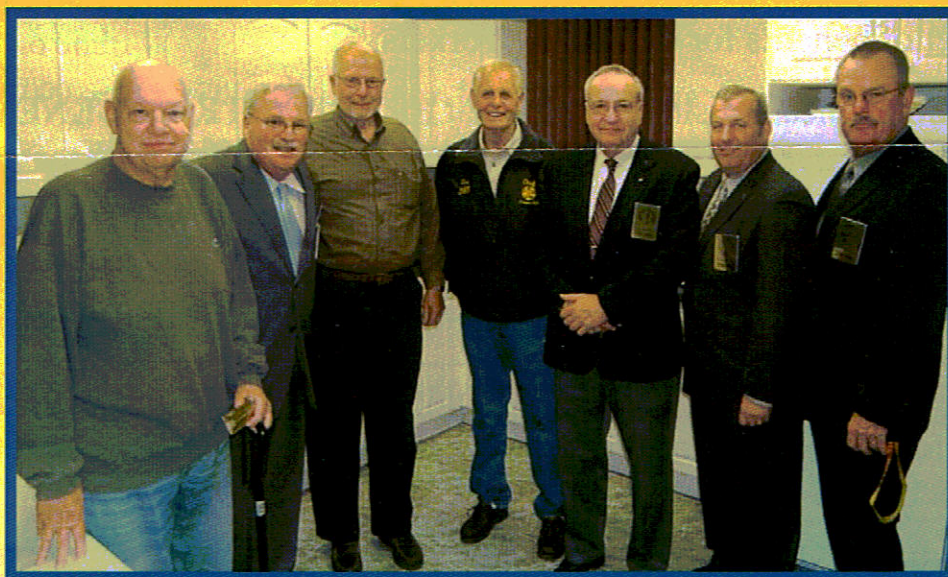
2012 Life Members with Board Members

The meeting will be held at 416 Atlantic Avenue, Freeport, NY