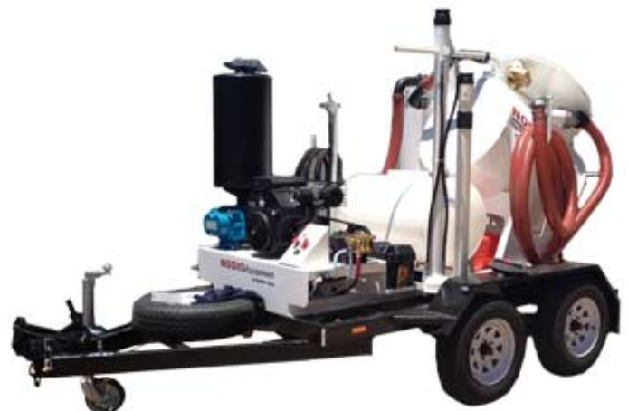
VM500 Petrol Unit on Trailer