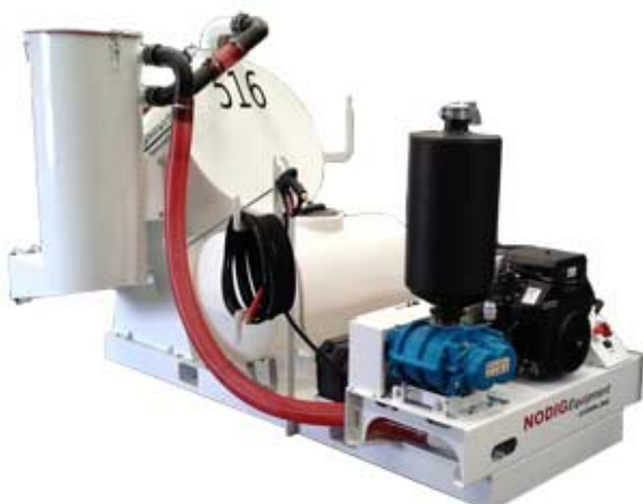
VM500 Petrol Unit on Skid